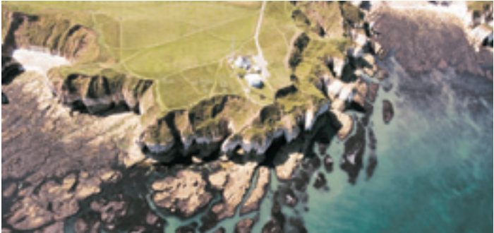
The Fog Signal Station on the tip of the headland

S STORYBOARD – discover the story of migration here.